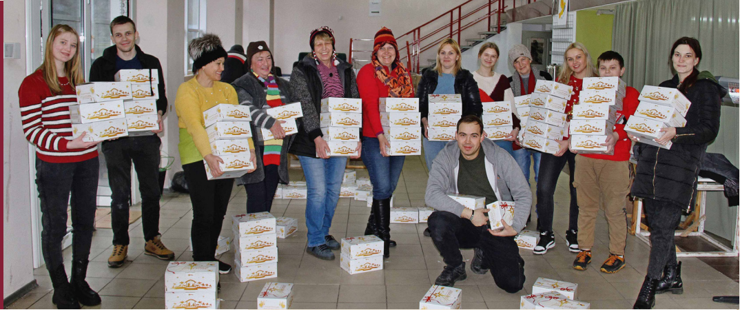
Ukrainian refugees in Poland express their gratitude by volunteering to help.

The refugees we help are always deeply grateful for the kindness they receive through Gift of Hope and other programs. Many of them respond by volunteering to help pack the Gift of Hope boxes and then distribute them to others.