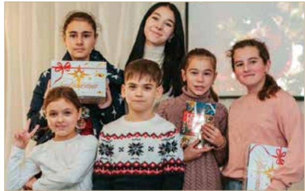
Fatherless children received God's comfort and love along with their Gifts of Hope.