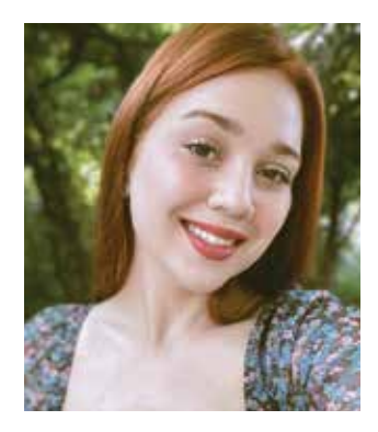
Angelina guided Sasha into a genuine relationship with God.