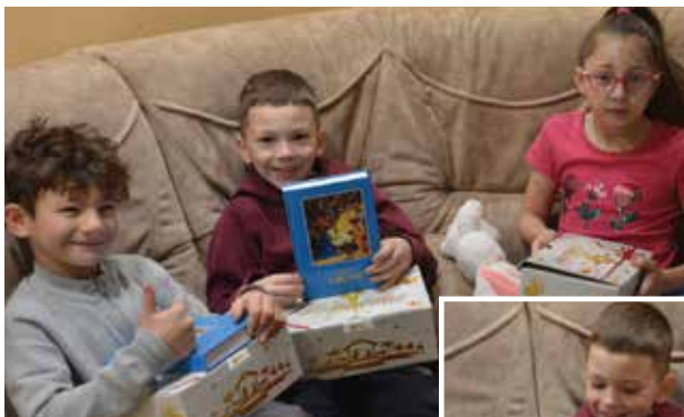
Receiving their Gifts of Hope, the children received a momentary respite from the horrors of war.

Yet, moments of happiness are possible even in this dark environment. This past Christmas, these siblings received Gift of Hope boxes, each one with a beautifully illustrated Bible. It reminded them how their mother used to read to them from the Bible when they were younger. Now, with their own Bibles, they immediately began searching for the Christmas story. This is how God provides comfort and hope even in the hardest moments.